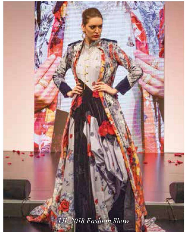
IJL 2018 Fashion Show